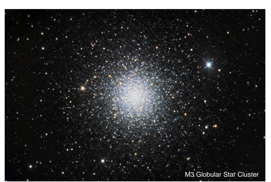
My accompanying images are all long integration times approaching 40 hours. Nothing replaces a lot of signal. Image processing with large data sets make for pleasing results. I hope you enjoy.