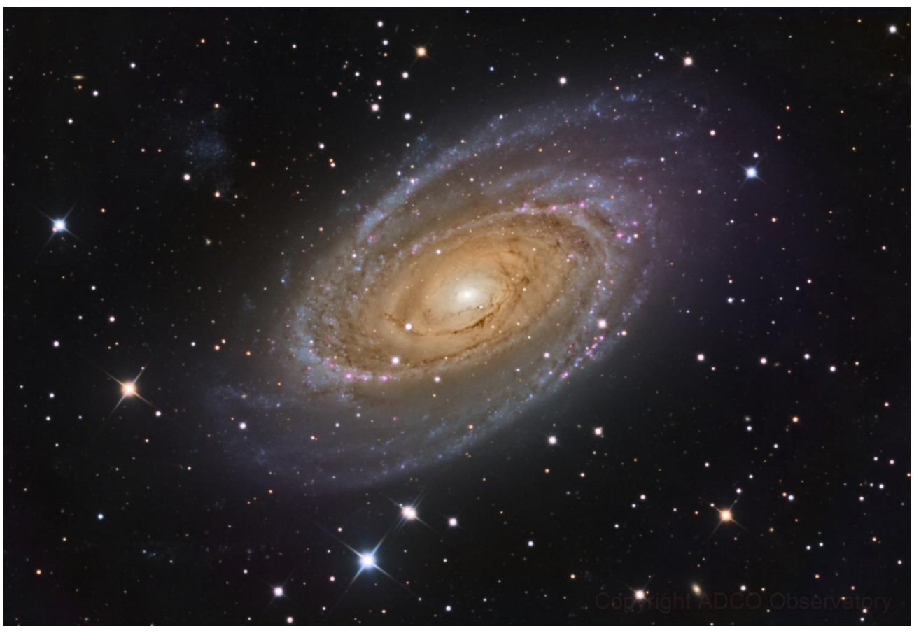
M81 Bodes Nebula

Astronomy has always been in my blood. My parents noticed it when I was just a toddler looking up at the sky hoping to see the moon. It fascinated me. The stars along with the nuclear age fostered my desire to be a physicist. My first telescope was a 2.4" refractor on an alt-az mount where I struggled to capture the Messier objects. The temperature didn't matter. I was out there in the middle of winter in early mornings with that little rig. Subscribing to Sky and Telescope magazine and then Astronomy introduced me to those who spent hours at an eyepiece to capture images on film. I said...not for me though I did capture an out of focus partial solar eclipse at 16. But then Richard Berry introduced the cookbook CCD camera and I got hooked. I coupled it to a 10" Newtonian