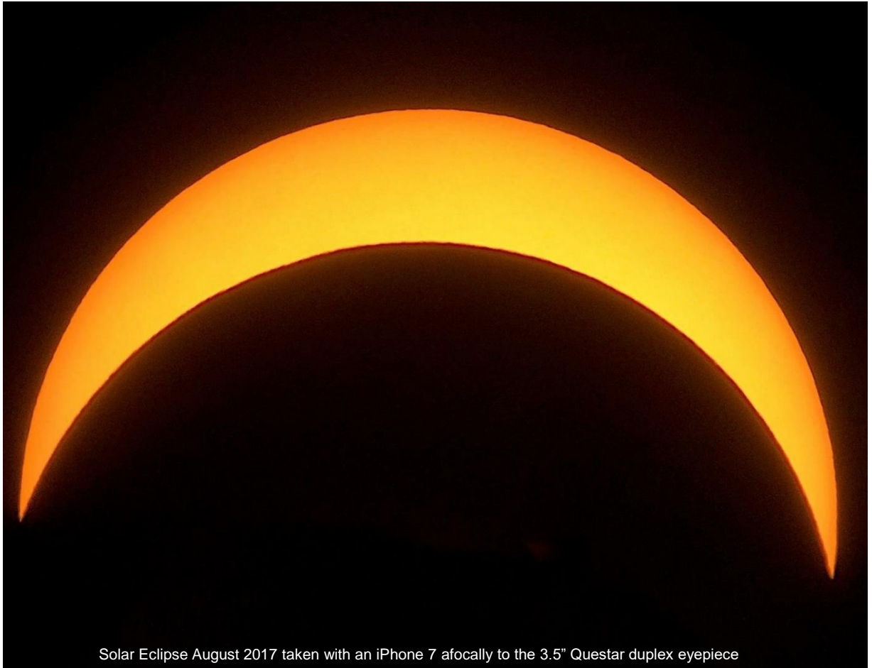
Solar Eclipse August 2017 taken with an iPhone 7 afocally to the 3.5" Questar duplex eyepiece

Growing up in a small oil company town in Oklahoma I loved to glance up at the night sky and admire the milky way and constellations. It never occurred to me that clear dark skies were rare until I moved to Oklahoma City to go to college. The dark sky memories were imprinted in my young mind and would be with me forever. More to say about that later on in this article.