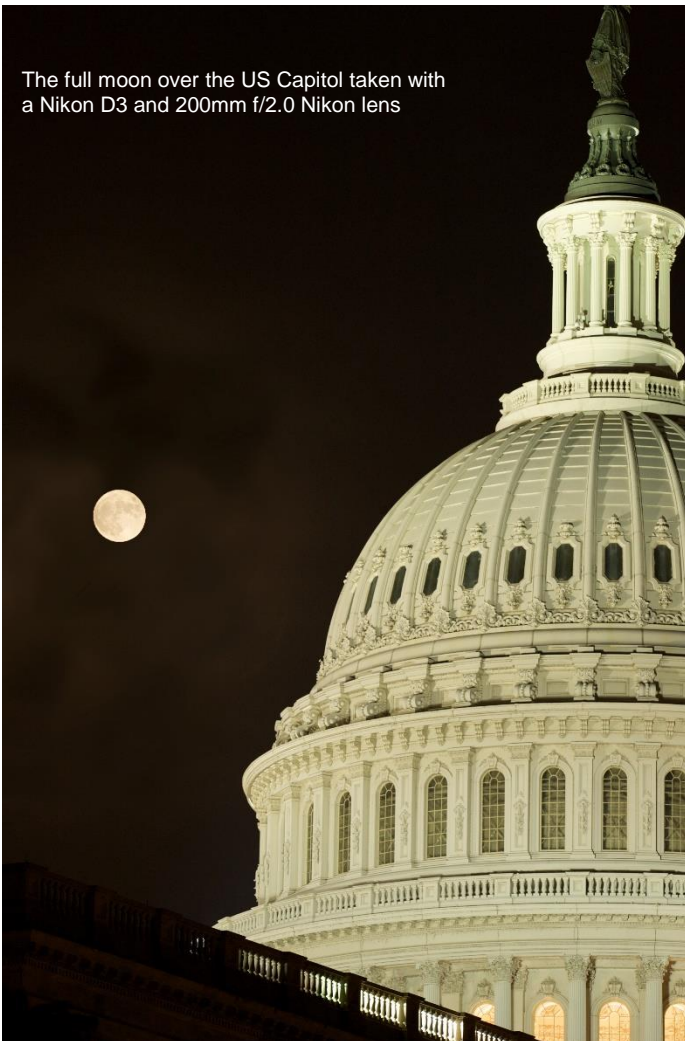
The full moon over the US Capitol taken with a Nikon D3 and 200mm f/2.0 Nikon lens

During high school and college, I avidly read Scientific American and carefully studied every Questar Telescope ad in each month's magazine. After college and grad school I went to work at one of the research and development facilities of a large super computer company, Control Data Corporation. I still read Scientific American and followed the Questar advertisements and after saving up money for over 25 years finally felt comfortable ordering a Questar Duplex without ever actually seeing one. I picked the duplex model so I could use the optical tube as a camera lens and have the option to do astronomy later remembering the skies of my hometown. The Silicon Valley skies where I started working, then the Minneapolis skies, and later on the Washington DC skies were all terribly light polluted; these skies didn't grab my attention so the Questar remained a terrestrial camera lens for a number of Nikon SLR cameras and eventually the DSLR models.