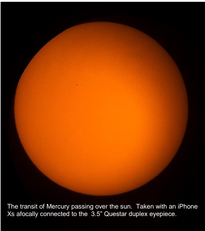
The transit of Mercury passing over the sun. Taken with an iPhone Xs afocally connected to the 3.5" Questar duplex eyepiece.