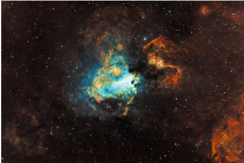
M17-SHO Hubble 3

More YouTube Videos, more research and astrophotography articles to sharpen my imaging skills. Post processing was a challenge at first, but like they say...practice...practice – practice.