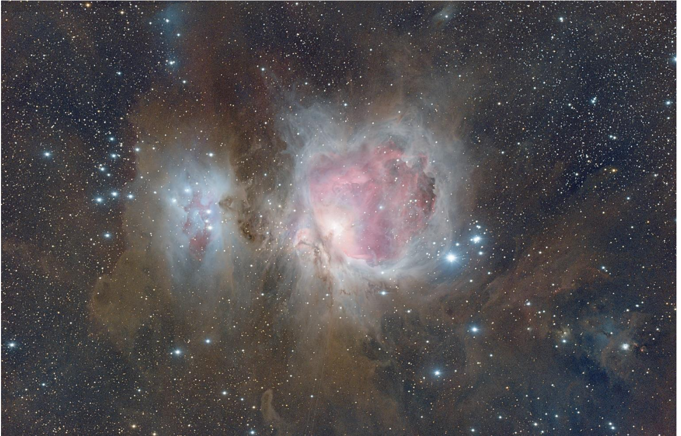
Messier 42 (Orion) – 30 5sec. exp. and 30 180sec. exp. – OSC CMOS camera

About 20 years ago, my wife and I were invited to a dinner in Tucson sponsored by a company we had been doing business with. This company arranged with Starizona to have 4 or 5 telescopes setup outside so that, after dinner, the guests could view what these telescopes were set to and talk to the astronomers there. We were both fascinated by what we saw. I remember both of us went to view Saturn and were blown away. We were convinced there was a sticker in front of that scope since Saturn and its rings were so clear and sharp. Our wedding anniversary was the next day, and my wife bought me my first telescope from Starizona that day as a surprise. It was an 8" Celestron SCT with an Alt/Az mount. I played with it for several months after that, but since I was still working,