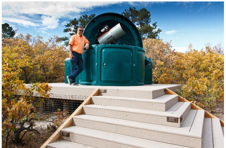
My SkyShed Pod observatory with a 14" SCT in Colorado

Are you a First Contact Polymer user and Astro Imager? Contact us at sales@photoniccleaning.com for the chance to be selected as a featured guest in an upcoming issue of Amateur Astrophotography Magazine courtesy of Photonic Cleaning Technologies! Not familiar with our products? See our ad on the next page or visit us at http://www.photoniccleaning.com