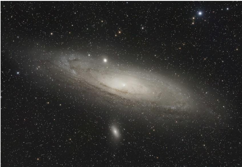
Messier 31 (Andromeda) – 60 120sec. exp. – OSC CMOS camera