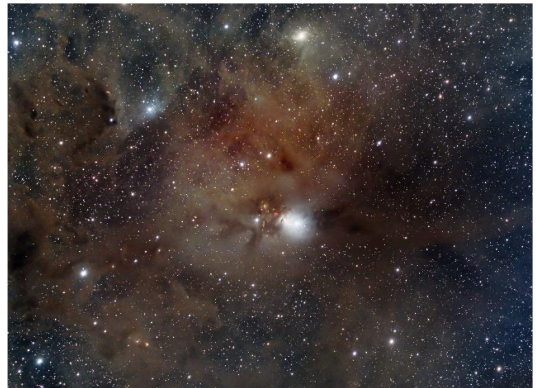
NGC 1333 (Embryo Nebula) – 43 180 sec. exp. – OSC CMOS camera

Like all astrophotographers, I constantly look for better hardware and software to enhance the pictures I take. I currently have a 14" Celestron SCT with Hyperstar, a 100mm Skywatcher refractor, a small "observatory", and 3 ZWO CMOS cameras. Keeping all the optical train surfaces as clean as possible is always mandatory, so using First Contact Polymer from Photonic Cleaning Technologies is a requirement.