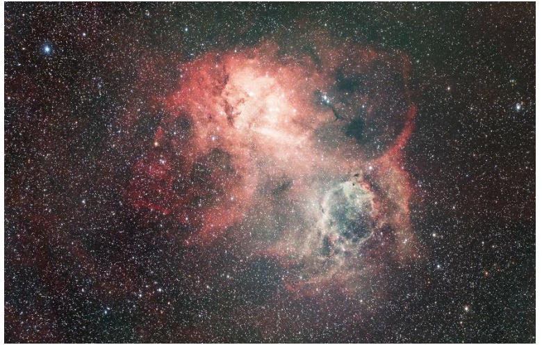
Sh2-132 (Lion Nebula) – 49 300sec. exp. – OSC CMOS camera

You realize that there is NOTHING between you and the DSO you are imaging. NOTHING. And, the extremes of what you are imaging in terms of size, temperature extremes, velocity, gravity, etc. can be intelligently discussed, but is totally incomprehensible. My favorite description of this phenomenon was a quote I heard from Martin Rees, a famous astronomer and astrophysicist from Cambridge University in Great Britain (and main subject of many great YouTube videos), "Man trying to comprehend the cosmos is like a guppy trying to comprehend a tree."