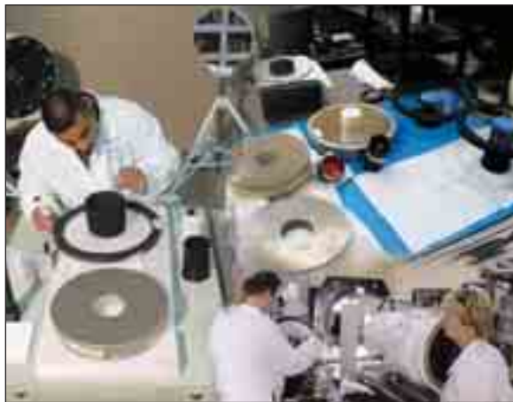
The WRDOG staff protects Mirrors and Corrector Plates with the polymer solution. Clean components from several telescopes are protected from recontamination while waiting for telescope assembly. Technicians may work without gloves until the film is removed after the mirror is placed in the telescope.

poorly adhered coatings since if the coating/substrate interface is weak or in poor condition, the coating may be removed by any cleaning activity. This caution applies to traditional cleaning methods as well as strip coat cleaning.