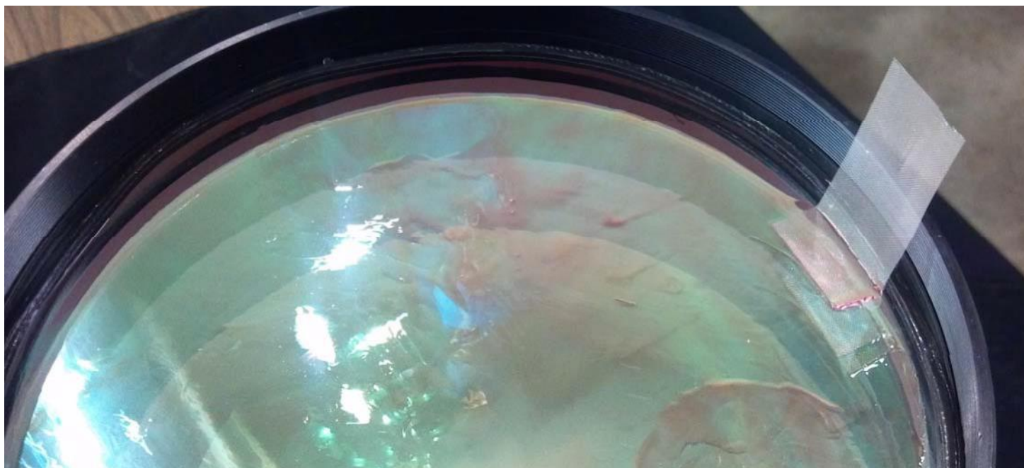
Here is the lens partially coated with polymer with the oring acting as a dam to stop the polymer flow. Chemical resistant mesh (FCNet) is embedded in the partially dried polymer as a handle to peel once dry