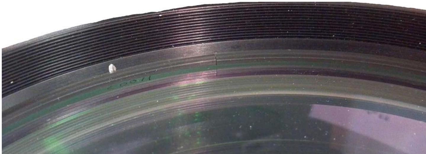
Here is an oring placed around the perimeter of an 8"D Studio-style lens with ends butted together at the 12-o-clock position